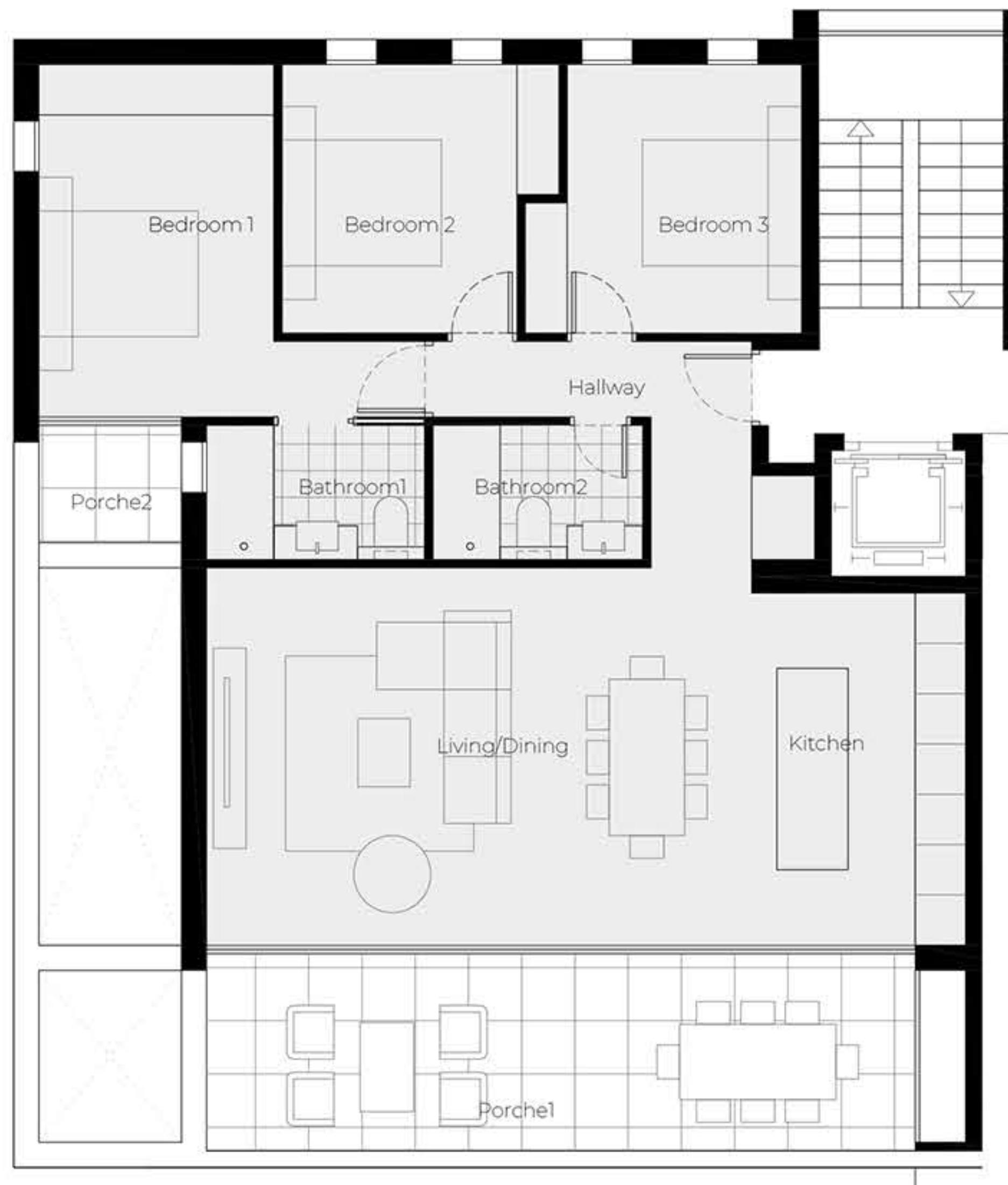
TYPE C - SECOND FLOOR